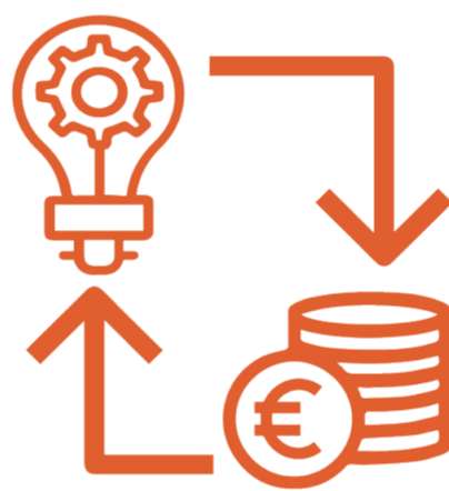
Attracting funding for uptake