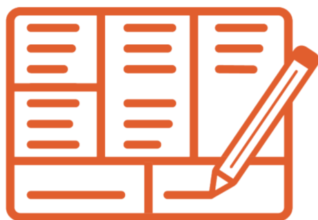
Business model development